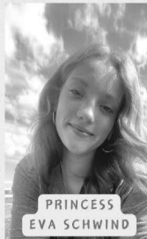
PRINCESS EVA SCHWIND