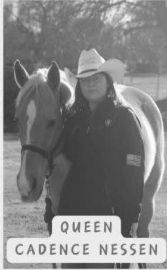
QUEEN CADENCE NESSEN