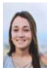
Princess Rilee Frates