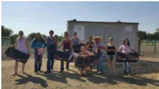
Murillo Clasic High Point Winners