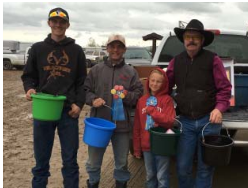
Winners March 5th show:

Our next show is April 2nd at Robertson Park. It will be an A Set (Skill). We will hope for some dry weather and hope to see you all there!