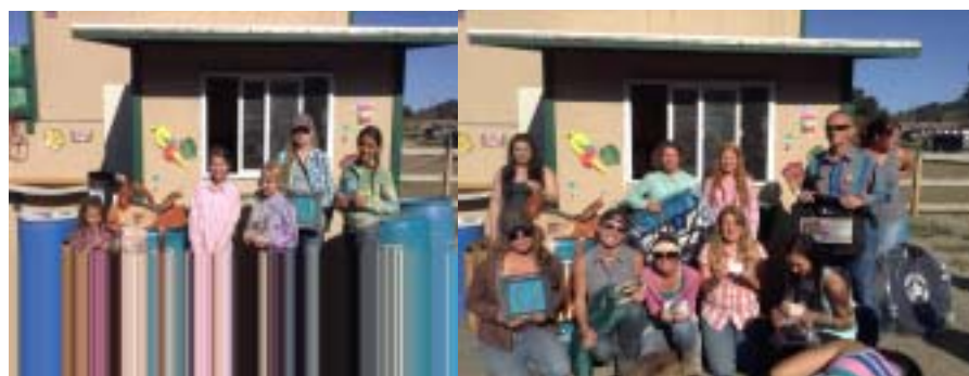
FC 12/under Champions

Until next time be safe and wear those helmets!