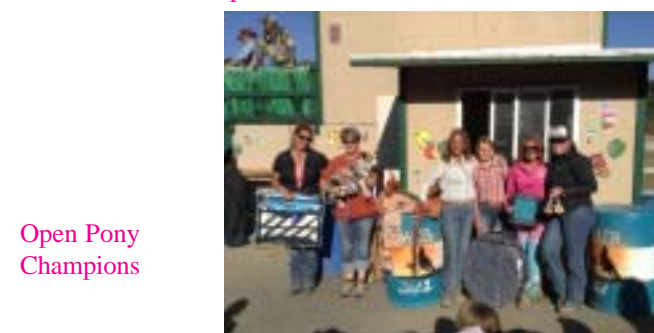
Open Pony Champions