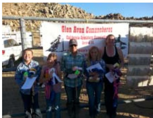
District 15 High Point Winners