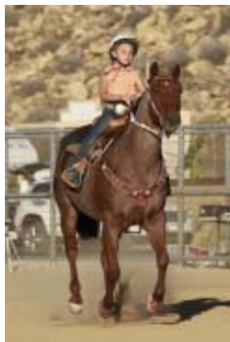
Dakota & Little Red