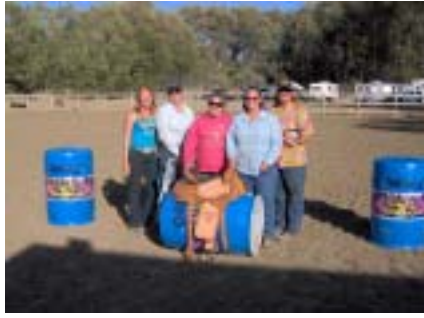
Future Champion 13/Over