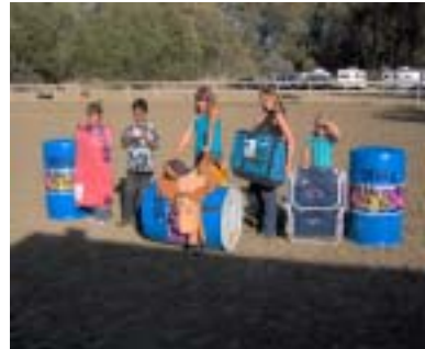
Future Champion 12/under