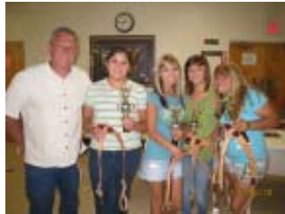
A - 1