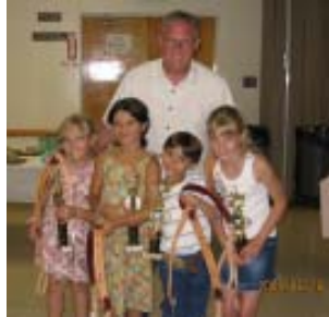
FC - 1