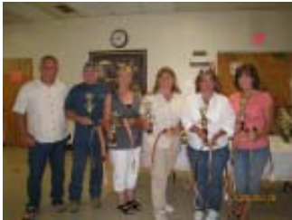
FC - 2