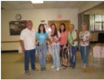
A - 2