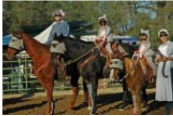
“The Mouse Family”