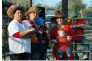
“Our Judges have been busy”