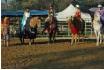
Halloween Costume Winners